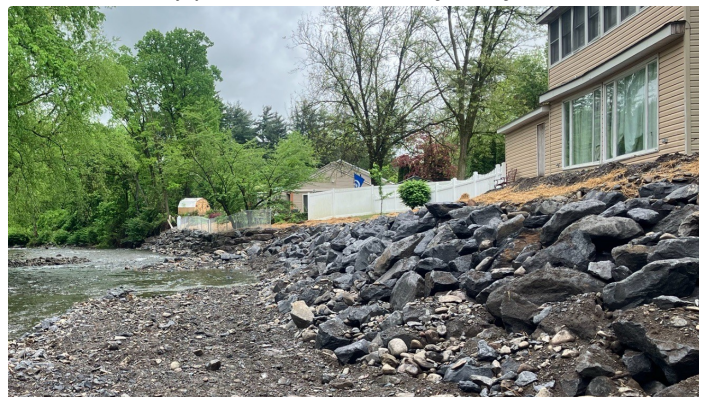
After: With NRCS funds, this streamfront property now has stable streambanks