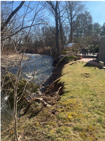
Before: a very steep, eroded streambank

as a result of the accelerated erosion taking place there.